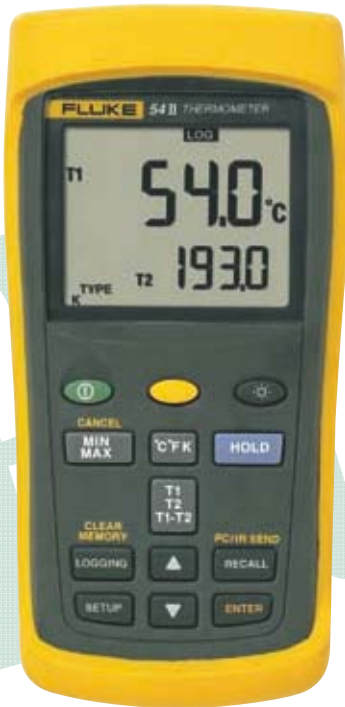
Fluke 54 II