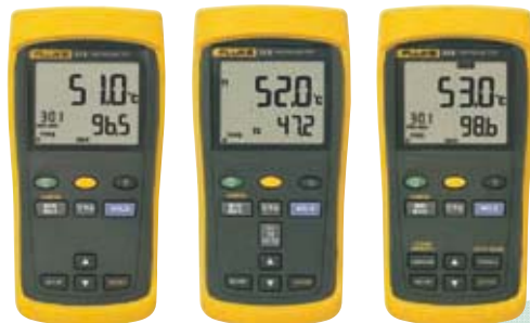
Fluke 51 II