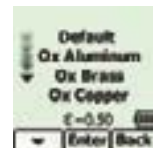
Select the measurement surface