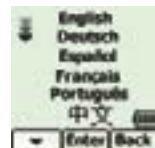
Choose your language