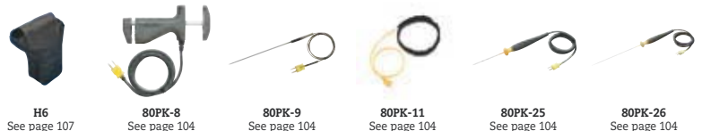
H6 See page 107