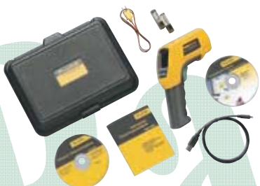
The Fluke 568 and included accessories