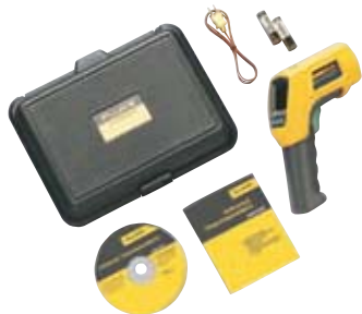
The Fluke 566 and included accessories