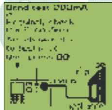
Earth Bond Test (RPE)