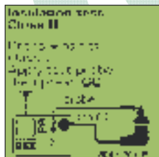
Insulation Test (RISO)