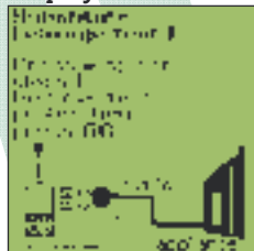
Substitute Leakage Current Test