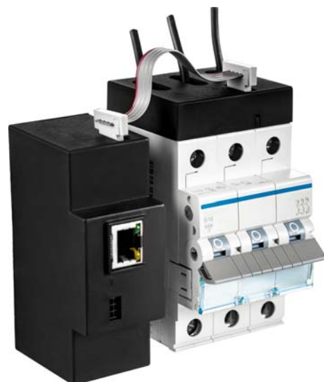
Figure 1 Application Example: Basic Module, Sensor Module and 3 Single-Pole Circuit Breakers

The ENERGYSENS can be quickly integrated into any system environment without programming knowledge with the help of a configuration program. This software can be downloaded from our website free of charge. An energy data management program, for example SMARTCOLLECT, is required for operation. A free test version of this program can also be downloaded from our website.