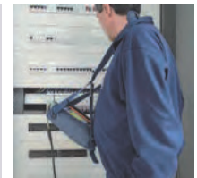
SP-0400 Hands-free kit