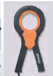
HT96U clamp for AC leakage current