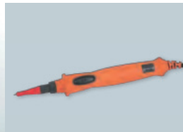
PR400 Switch probe