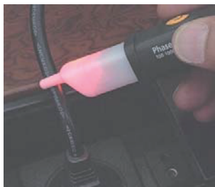
AC voltage detection