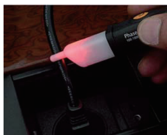
Incorrect phase sequence