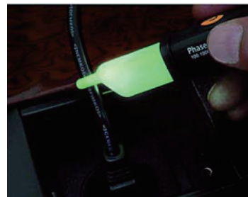
Correct phase sequence

This product conforms to the prescriptions of the European directive on low voltage 2006/95/EEC and to EMC directive 2004/108/EEC