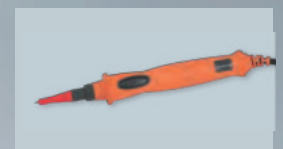
PR400 Switch probe