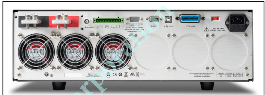
Model 2380-500-30 rear panel